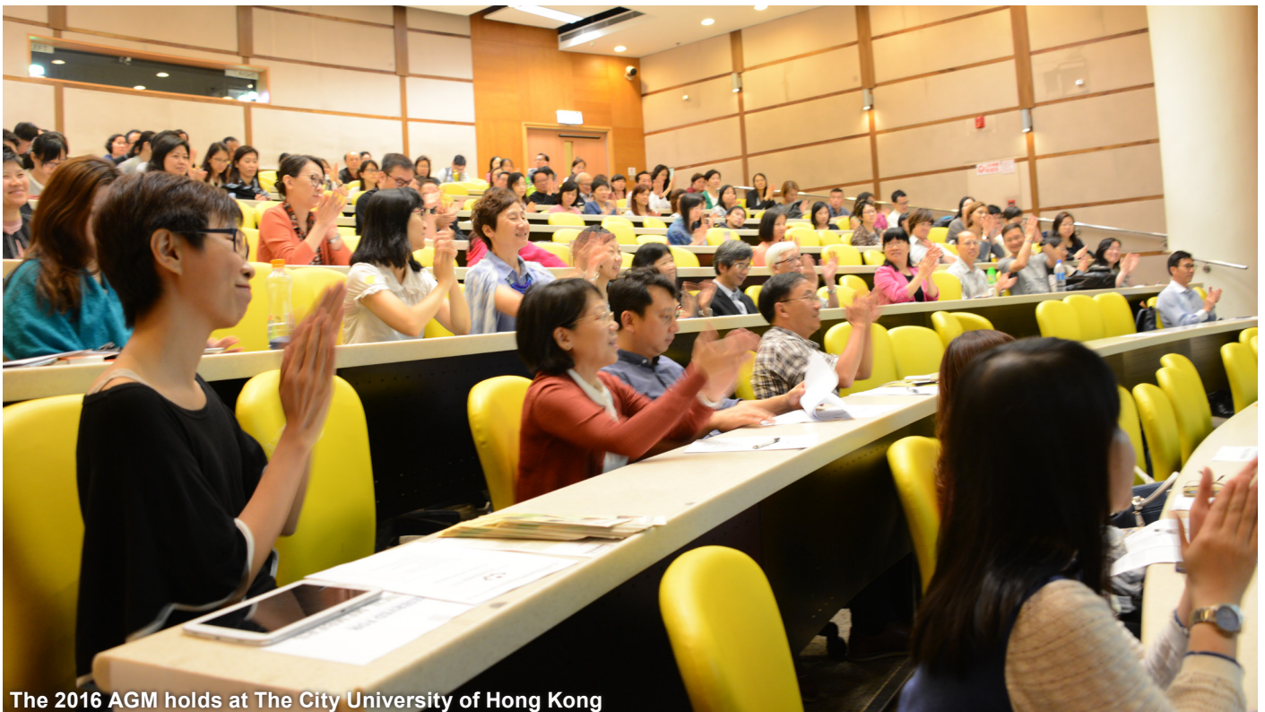
The 2016 AGM holds at The City University of Hong Kong