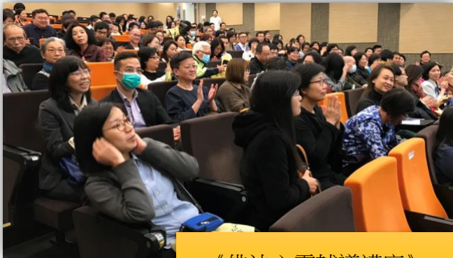
《佛法心靈輔導講座》 由釋衍空法師主講 (3月6日 - 共2小時)