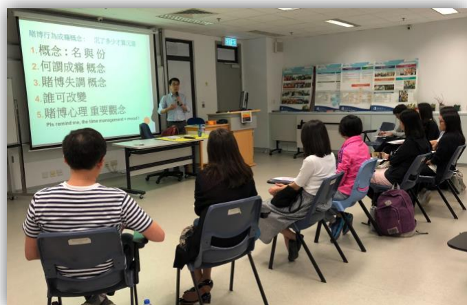
《賭博行為成癮概念：沉了多少才算是沉溺？》 由李紹麒先生主講 (2018年10月12日)